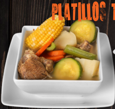
Caldo de Res