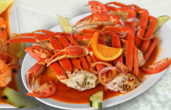
Patatas de Jaiba MP$ Crab legs