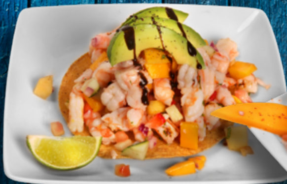
Tostada de Camarón