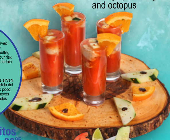
⊛ Los Chapitos

AVISO AL CONSUMIDOR Los artículos marcados con un asterisco (*) se sirven crudos, poco cocidos o son cocinados a pedido del cliente. El consumo de alimentos crudos o poco cocidos como carne, aves, mariscos o huevos puede aumentar el riesgo de enfermedades transmitidas por alimentos, especialmente si usted tiene ciertas condiciones médicas