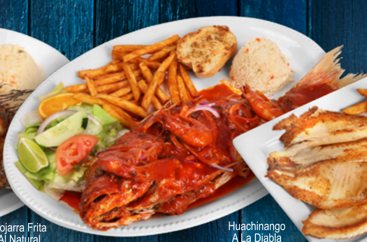
Huachinango A La Diabla