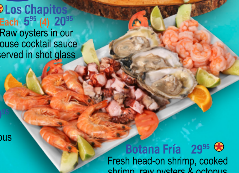
Botana Fría 29 95 ⊛

Seafood tower, includes shrimp, octopus and fish ceviche, served cold