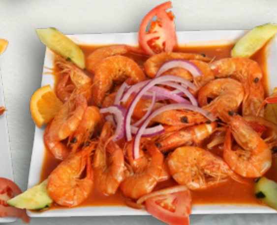
Camarones Cucaracha Sm 33 95 Lg 59 95 Fried head-on shrimp in our house spicy sauce