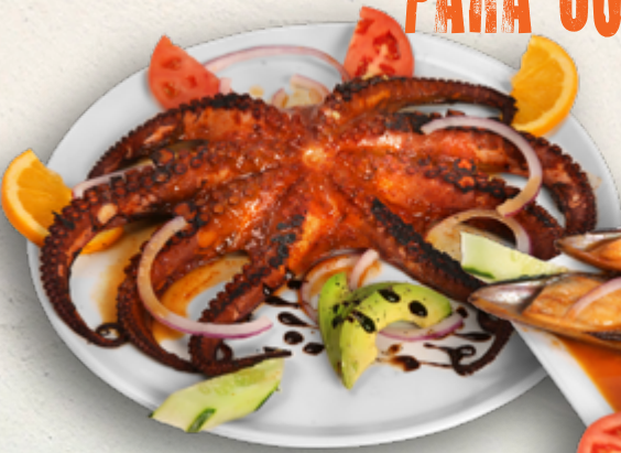
Pulpo Zarandeado MP$ Grilled butterflied octopus in our house spicy sauce