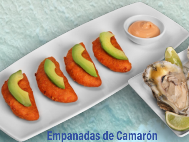
Empanadas de Camarón