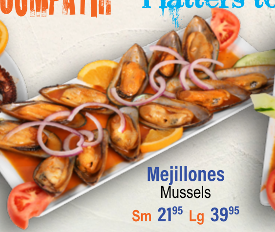
Mejillones Mussels Sm 21 95 Lg 39 95