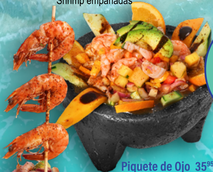
Piquete de Ojo 35 95

Raw oysters prepared with avocado, mango-pico de gallo and octopus