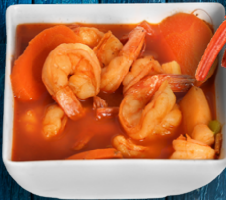
Caldo de Camarón