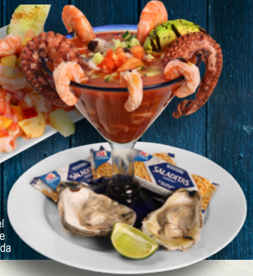
Coctel Vuelve A La Vida