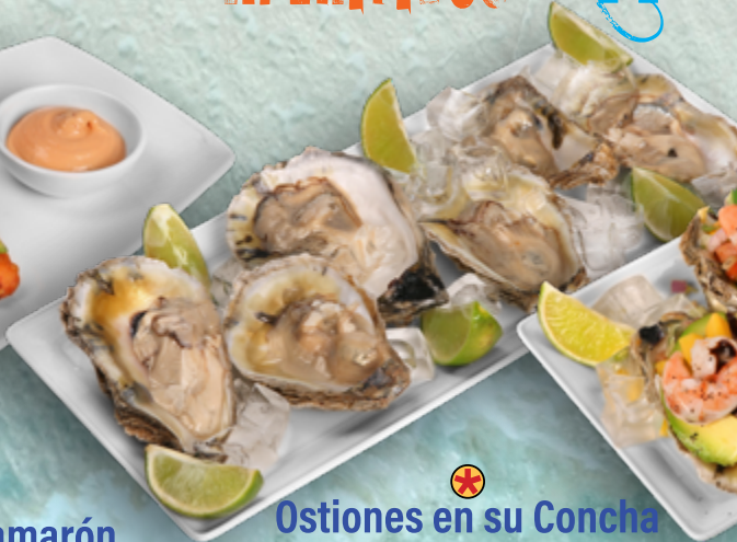
Ostiones en su Concha