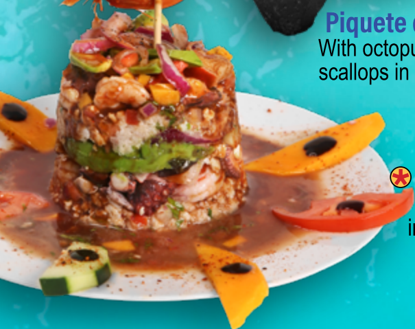
⊛ Emma Coronel 30 95

Raw oysters in our house cocktail sauce served in shot glass