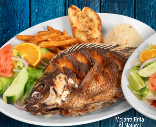
Mojarra Frita Al Natural