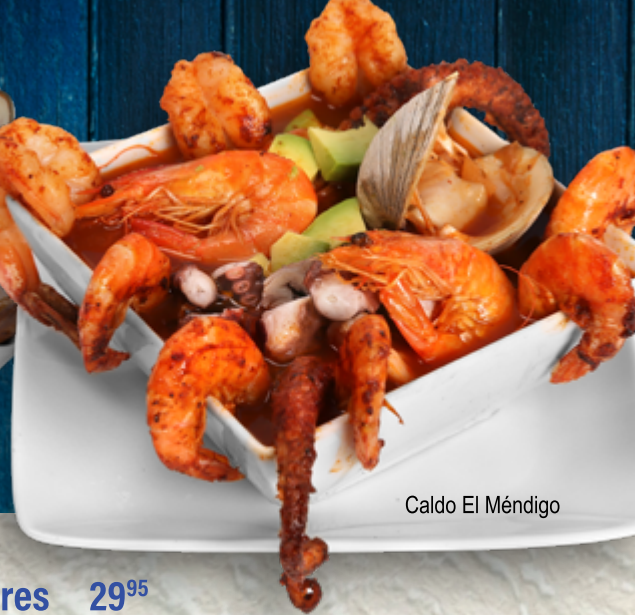
Caldo El Méndigo