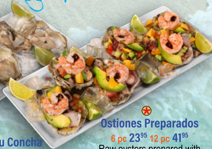
⊛ Ostiones Preparados