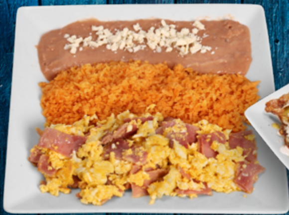
Huevos Con Jamón