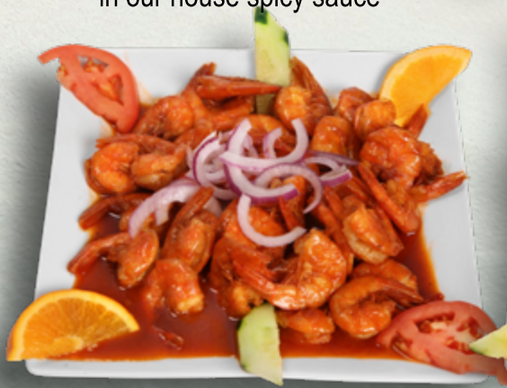
Camarones Cora Md 36 95 Lg 68 95 Shrimp in Spicy home sauce