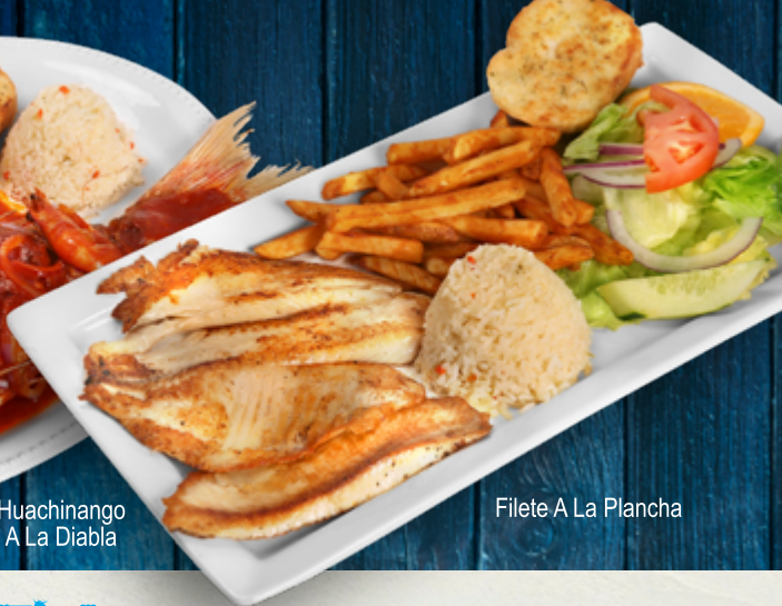
Filete A La Plancha