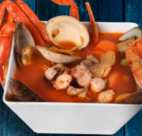
Caldo Siete Mares